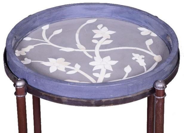
SKU: 17125387 Winfield Bone End Table 17"X17"X25" | 29 lbs | 6.48 CFT