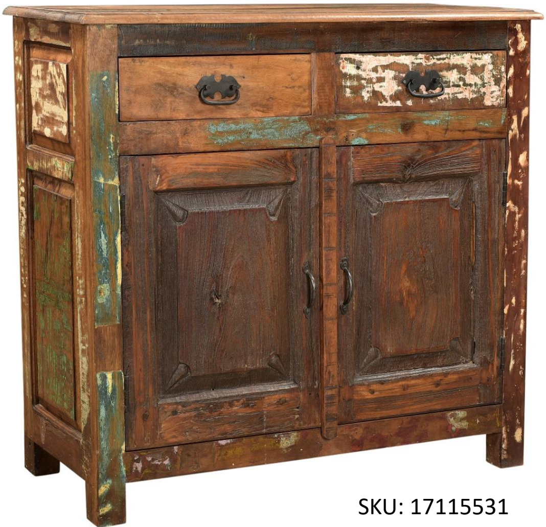
SKU: 17115531 Quent Cabinet 39"x16"x36" | 116 lbs | 18.01 CFT