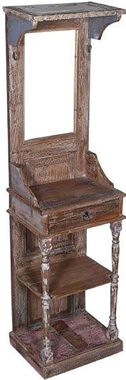
SKU: 18045481 Telfor Antique Hall Tree, 20"x15"x72" | 75 lbs | 17.97 CFT