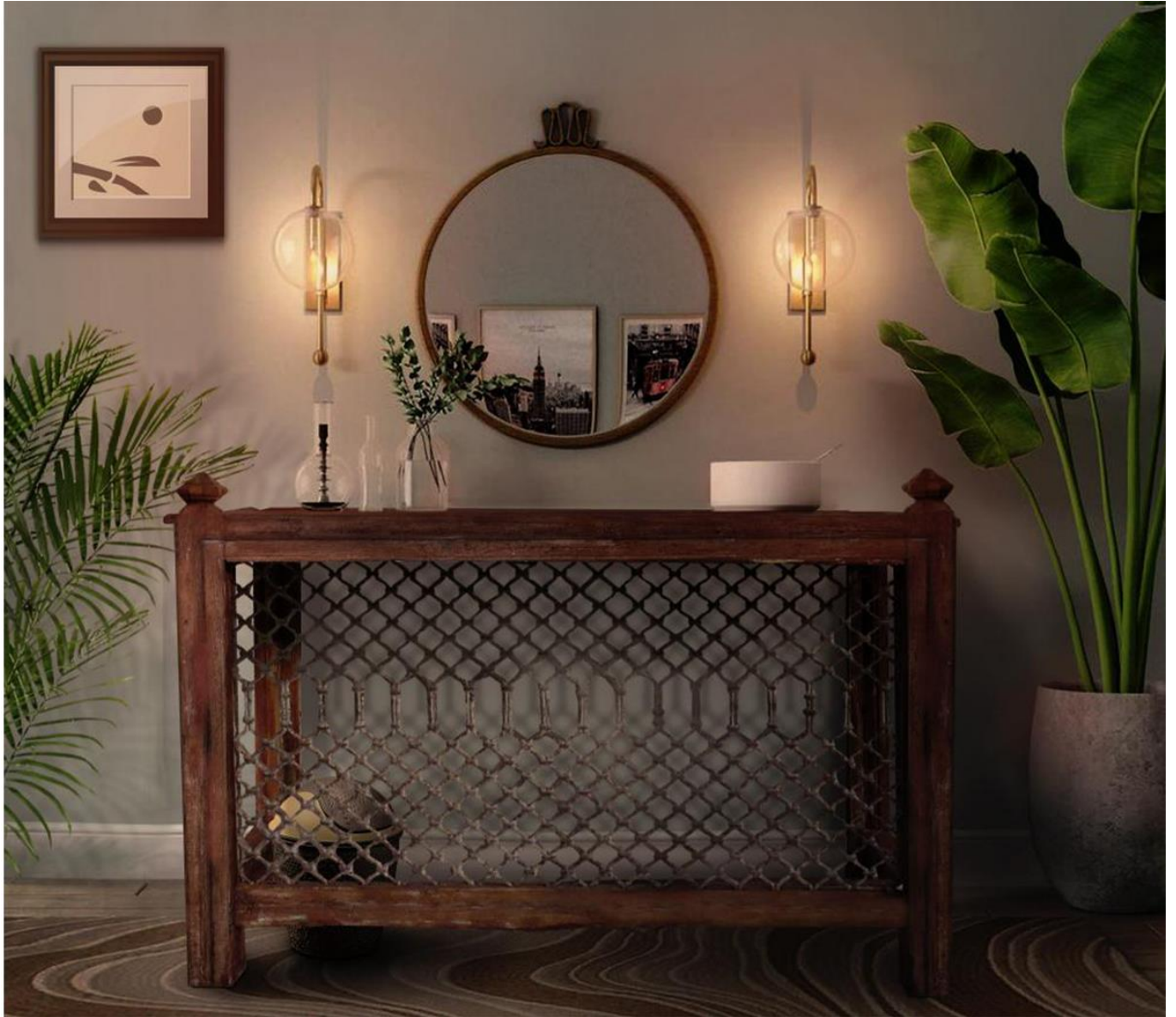
SKU: 17115647 Hendrika Console Table, 49"X16"X34" | 99 lbs | 21.16 CFT