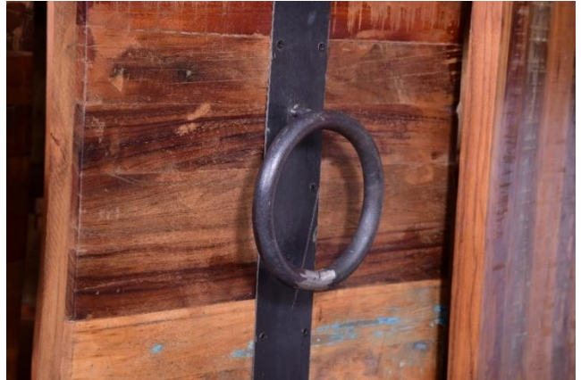
SKU: 17113660 Vallis Reclaimed Sideboard 60x18x29 | 130 lbs | 26.89 CFT