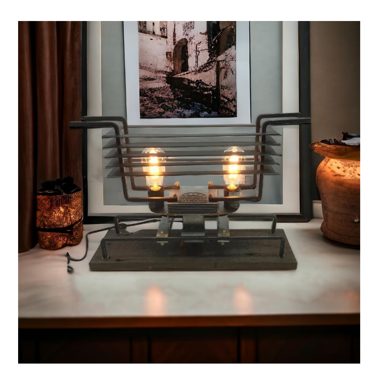
SKU: IL1521 Delano Lamp, 22"x8"x16" | 30 lbs | 3.86 CFT