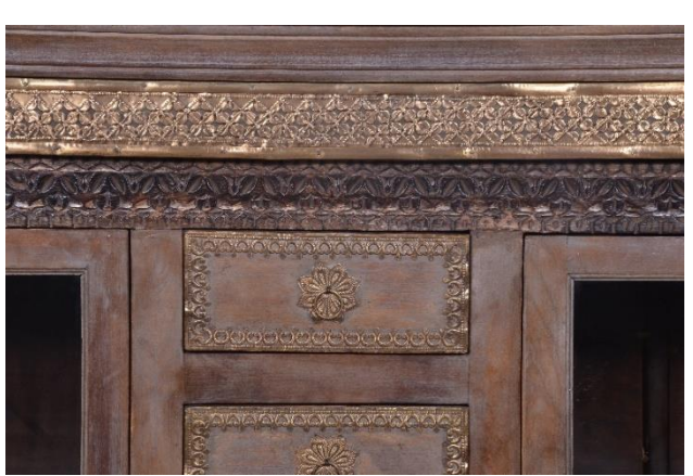
SKU: 17115649 Hilda Sideboard, 57"x16"x39" | 138 lbs | 27.71 CFT