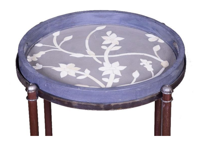
SKU: 17125387 Winfield Bone End Table 17"X17"X25" | 29 lbs | 6.48 CFT